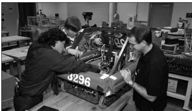
Schneider Electric employees help students design and build robots for competitions.